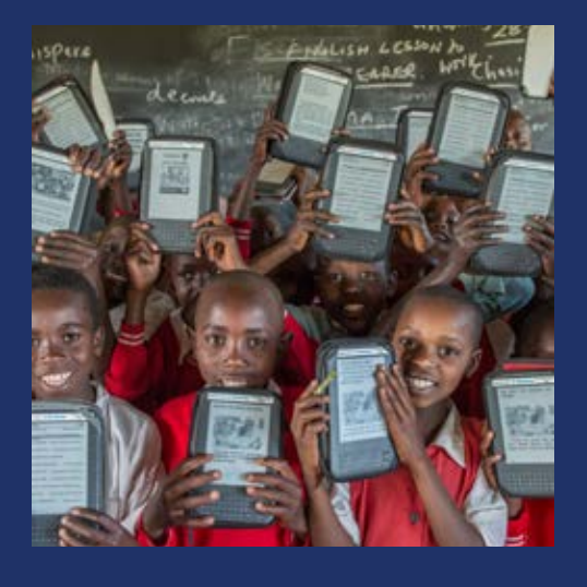
ALL CHILDREN READING: