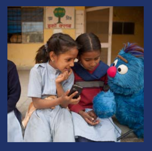
COLLECTION OF INNOVATIONS AND INNOVATORS