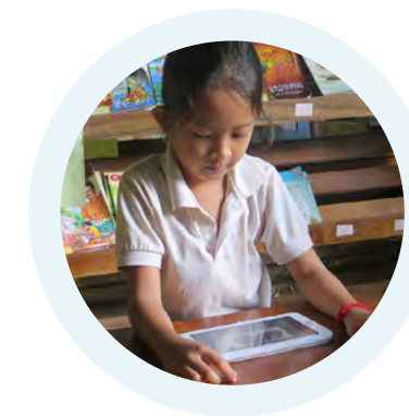
SECOND FROM TOP: WORLD VISION PHOTO

Recognizing the powerful role of pre-literacy as a foundation for a child’s future success, ACR GCD sources and tests innovative approaches for improving early childhood literacy and development. These solutions involve a continuum of actors—including parents, caregivers, teachers, schools, community members and policymakers—with the goal of empowering families, communities and societies to strengthen early childhood education programs and resources.